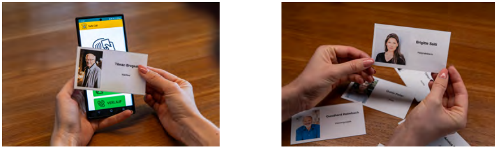
Fig. 1. Safe Call consists of physical contact cards and a smartphone app. The contact cards contain an NFC tag, allowing users to save contacts and call them with a tap. To indicate potential scams, the app adds a warning to incoming calls from unfamiliar callers.

FLORIAN ALT, Bundeswehr Universtiy Munich, Germany