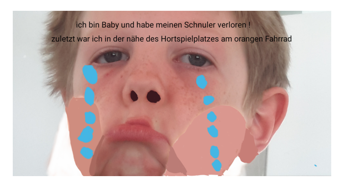
Figure 7. A highly sophisticated artifact, containing a modified photo and a textual hint wrapped up in a story.

We investigated the content of the treasure hunt such as the number of stations and artifacts (e.g., physical, digital, or GPS coordinate) as well as what kind of content was used (text and/or images, riddles, etc.). We also looked into how children created these pieces of content and which media (pen, paper, photo) they used. Note that in the AR version, content could