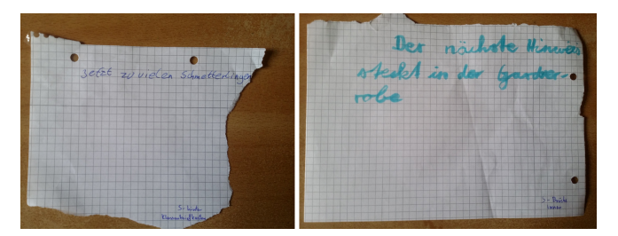
Figure 6. These exemplary traditional hints, send the players to "where the butterflies are" and "to the dressers". They are weakly linked hints consisting of nothing but text.