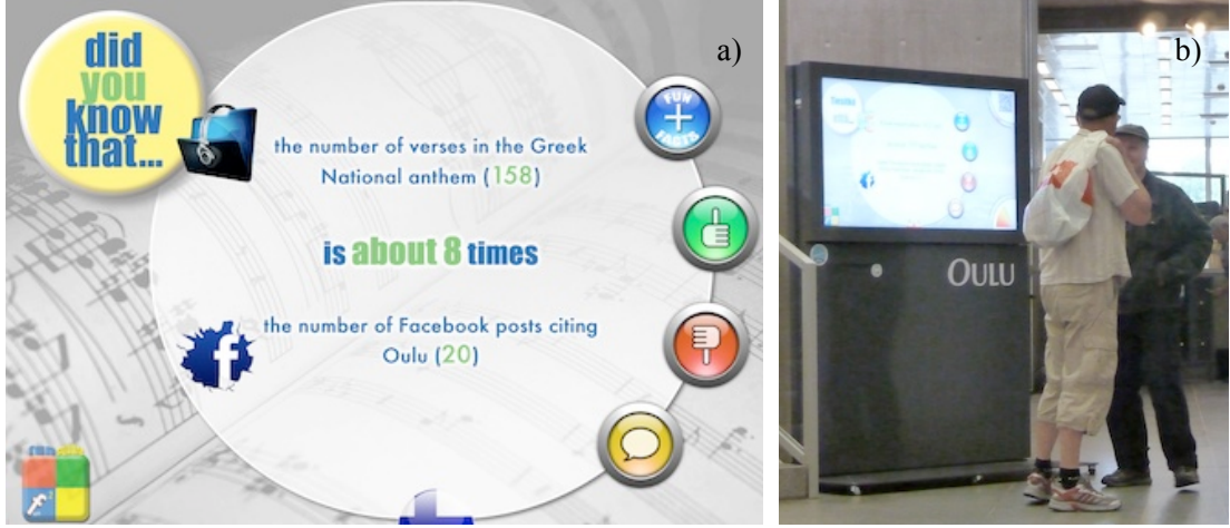
Figure 2 – a) A "Fun Fact" in FunSquare, and b) FunSquare App sparking triangulation

People go to public spaces to fulfil their needs, for example, relaxing by taking a nice evening stroll in the park, 'killing some time' by sitting on the bench and observing what other people are doing, or spending some time with their child on the playground. One of the needs we are pursuing in public spaces is active engagement with the environment and the people in it – independent of whether they are strangers in a site or members of a familiar group. As Carr et al. note we are more likely to socialize with other people in the space if the space contains an unusual feature such as a fountain, sculpture, or even street entertainment (Carr et al. 1992). This unusual feature often sparks the effect of 'triangulation' between people, an effect whereby the special feature of the place provides the link between people and prompts strangers to talk to each other.