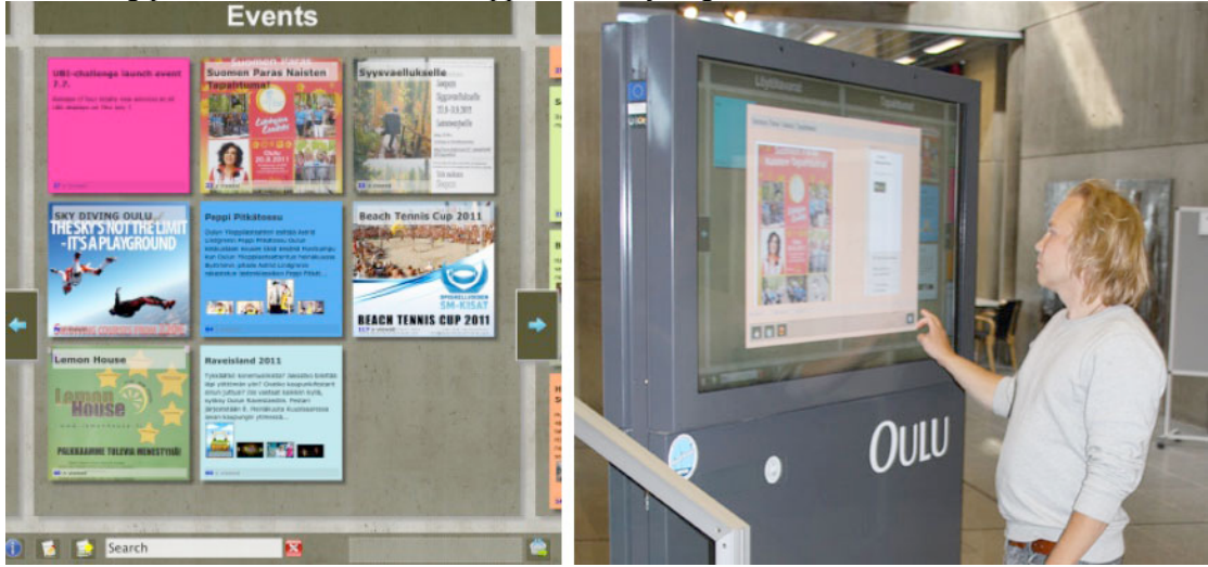
Figure 4: Digifieds User Interface (left), User Interacting with Digifieds (right)

finding is that PNAs are often used as a community support tool . We observed that at some locations, e.g., in an adult education center, the PNA was mainly used for the exchange of the study related material. This study confirmed our beliefs that networked public displays, i.e., interacting places, could be used to support identity cognition.