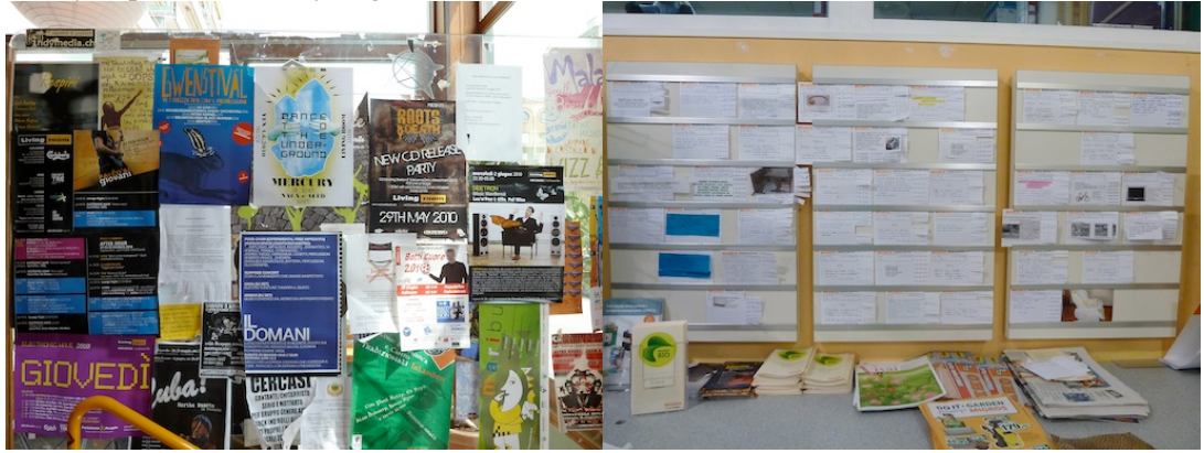
Figure 3 - Examples of data collected from the PNA study

Another way to support identity cognition would be through content that originates directly from people rather than the environment, i.e., content that expresses beliefs and ideals of a local community. Through this content, identity cognition is being stimulated explicitly by directly reflecting on community values. In order to define the properties of this type of content, we have conducted two studies. Our first study aimed at understanding how people communicate in public spaces through analog predecessors of today's digital displays, i.e., with traditional public notice areas (PNAs), more commonly known as notice boards (Alt et al. 2011). Our second study had a goal of comprehending and soliciting desires and wishes of a student community for the type of content they would like to see (Memarovic et al. 2011). Both studies aimed at bringing us closer to designing the interacting places content that directly expresses identity cognition.