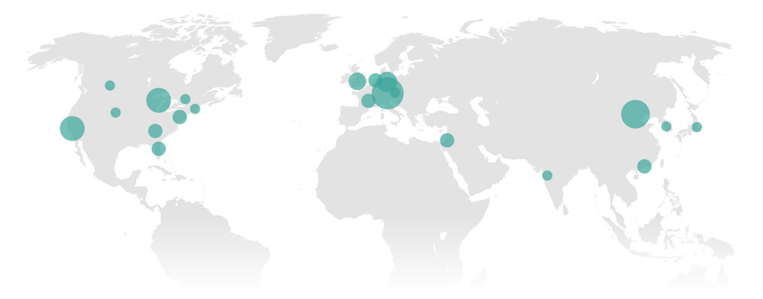
Fig. 3. Research on affective automotive UIs has been predominantly carried out in geographical proximity to major car producers and pertinent research institutes. Circle area represents publication count per region.

co-location with a DMV office [50], an idea which stands out as positive example because DMV visitors who come for official business regarding their driver's license or car registration are most likely engaged in the current car market and thus might represent a relevant sample group.