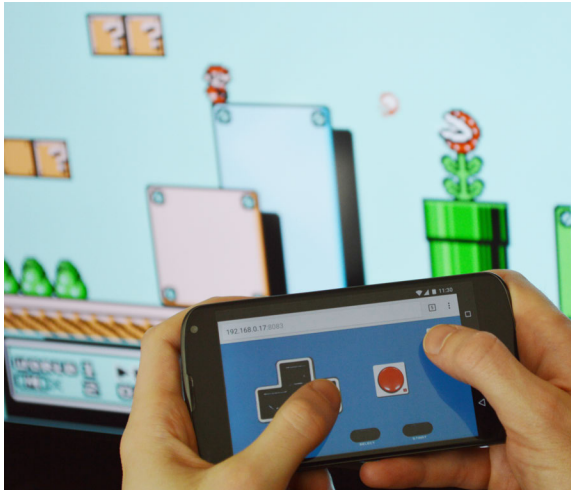
(a) An on-screen gamepad to control a platform game.