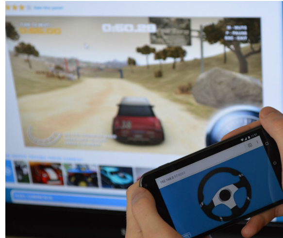
(b) Steering a racing car by tilting the device.