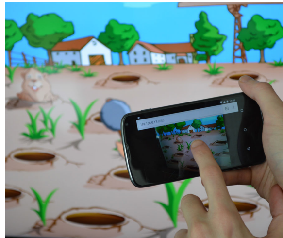
(d) Interacting with the screen through the camera viewfinder.