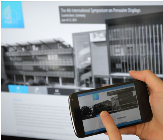
(c) A touch-enabled miniature view in full-screen mode.