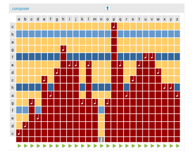
Figure 2: A composing tool allows to map tones to characters.

The sonification pipeline depicted in Figure 1 shows the process. To encode a message with a specific mapping, each single character is mapped to a note. In order to do this, the message is divided into sentences. For each sentence, the system tries to extract the mood/content of the sentence to select the sonification for this sentence. Punctuation within a message is used to encode its intention as chords. Instruments are used to encode the sender.