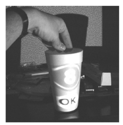
Figure 3: The Everywhere Projector [47]

When it comes to user interaction in front of public displays, two different types of interaction can be distinguished. Whereas in explicit interaction the user tells the computer in a certain level of abstraction what she expects him to do [53], implicit interaction describes an action, which is not in the first case targeted towards the interaction with a computer but nevertheless considered an input. For example, a user may walk through a door, causing the lights to go on. Similarly, he may type on a keyboard, and his typing patterns may be used to authentify him. In the following we present 10 interaction modalities, which allow for both implicit and explicit interaction in the vicinity of public displays.