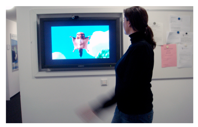
Figure 4: Reflective Signs [43]

explain how each of the mental models can be used to guide people through the interaction process.