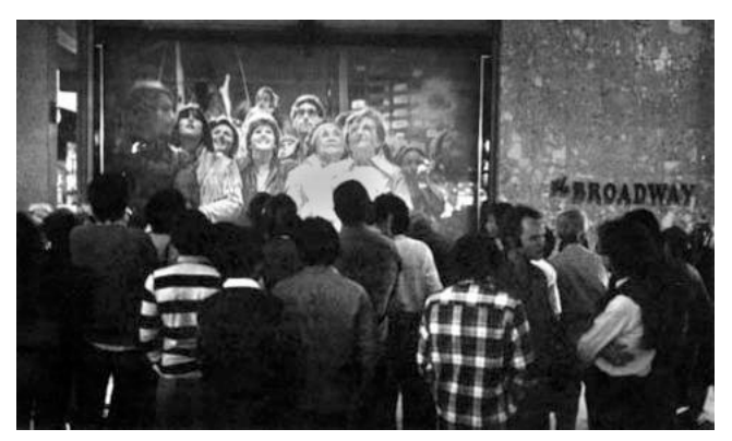
Figure 2: Hole-in-Space<sup>1</sup>