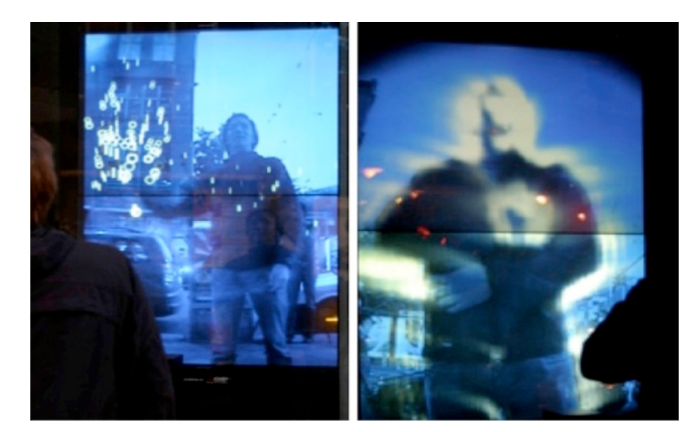
Figure 5: Magical Mirrors [37]

The Jumping Frog for the Everywhere projector [47] shows a frog on some surface in the environment. Implicit interaction is supported when a user accidentally steps nearby a frog displayed on the floor and the frog jumps away. This sudden movement may