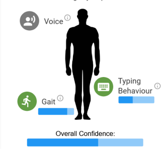
Figure 5: "Body Vis": A design giving continuous indication of the currently used biometrics and the system's confidence (both in the status bar and in detail).