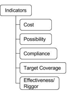
Figure 3: Classification of metrics for security indicators as proposed by Rudolph and Schwarz [8]. Some of these metrics are partially applicable to measure strength of behavioural biometrics.