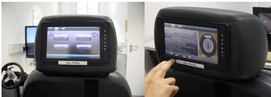
Figure 2: A touch display is embedded in the headrest.

Since the display is touchable, the passenger can interact with the user interface. In the idle mode the display shows different location-based advertisements. The passenger can start interacting with the system by touching the display. Then the menus are visualized and the passenger can select the contents. The contents provided are the available hotspots, restaurants and bars, news, and entertainments based on the current location. Additionally other entertainment contents such as games or videos are provided. Further, a small part of the screen is always reserved for advertising while the content is shown. Selecting the advertisements is done based on matching predefined location of each advertisement and the current location.